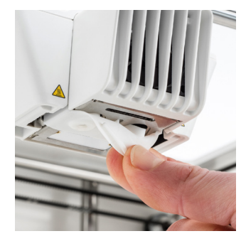
Nozzle covers x10 Replacement covers keep your print head in top condition

Unlock a wide range of applications with complete material choice. Use Ultimaker materials, any third-party filament, or access material profiles from leading brands. Choose from these materials and more.