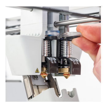
Print core AA 0.25, 0.4, 0.8 mm Quick-swap nozzles minimize downtime